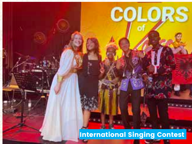
International Singing Contest